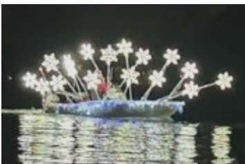
Another great Middle River Parade of Boats