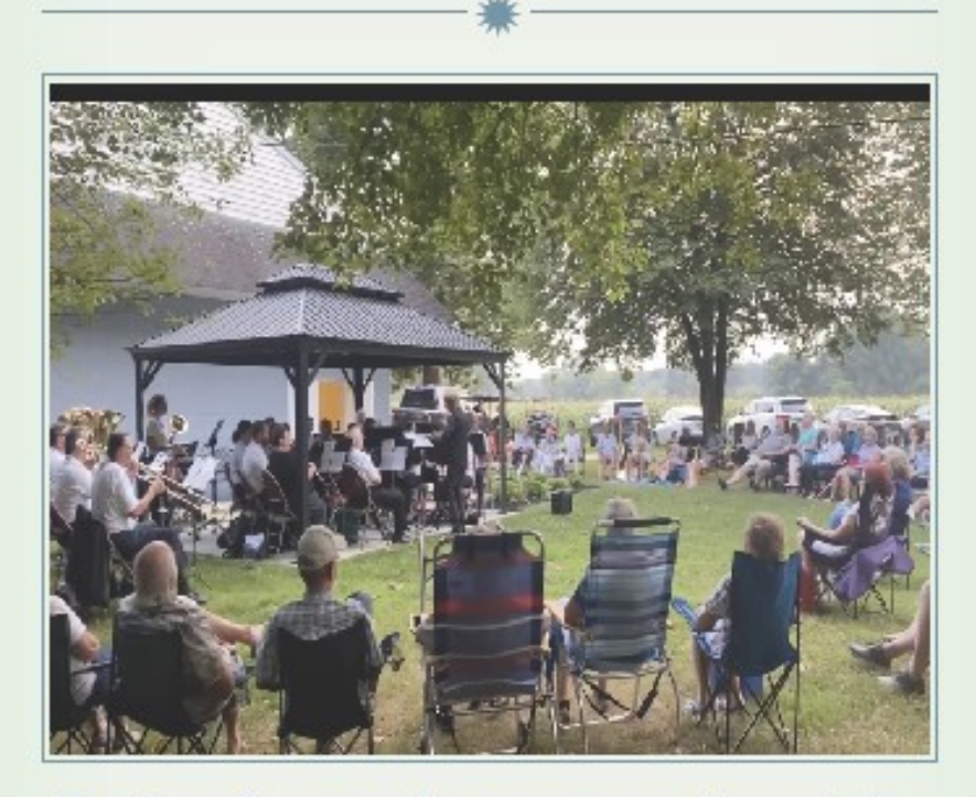
Bowleys Quarters Improvement Association 1124 Bowleys Quarters Road, 21220