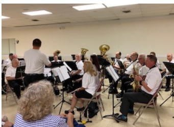
Thank you Middle River Concert Band for a wonderful evening in spite of the weather!