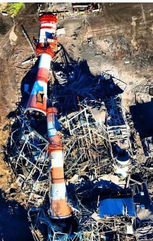
Big clean-up ahead.